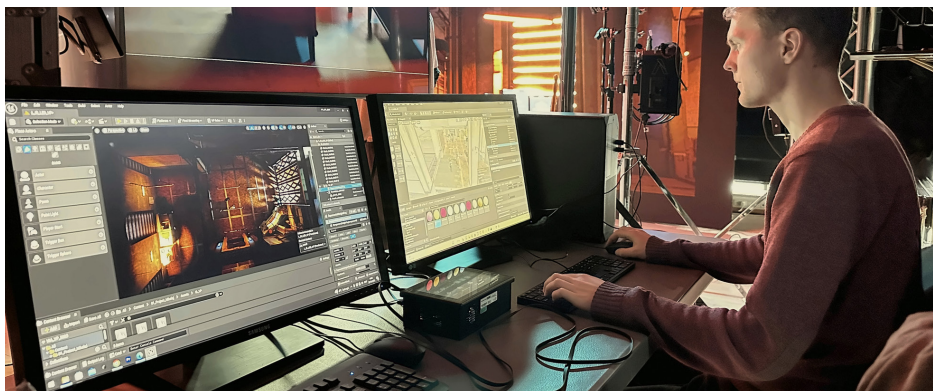
A Virtual Production setup at our facilities on campus (the MiXR lab).