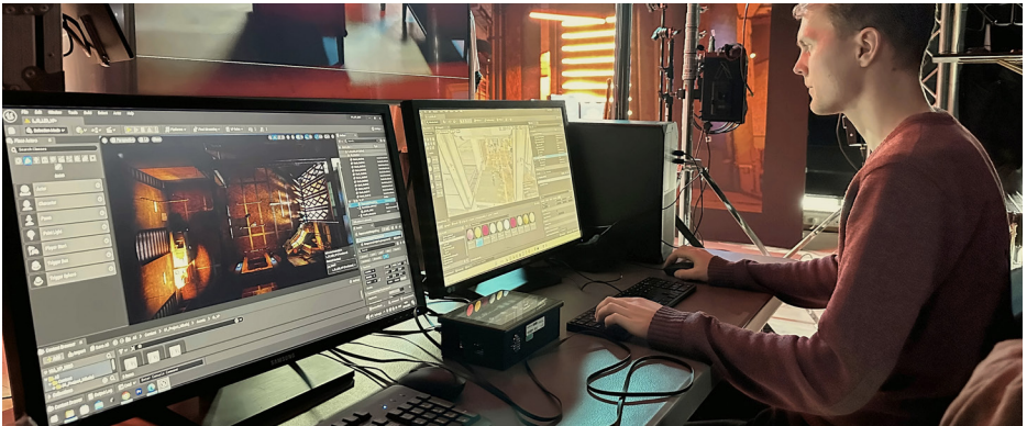
A Virtual Production setup at our facilities on campus (the MiXR lab).